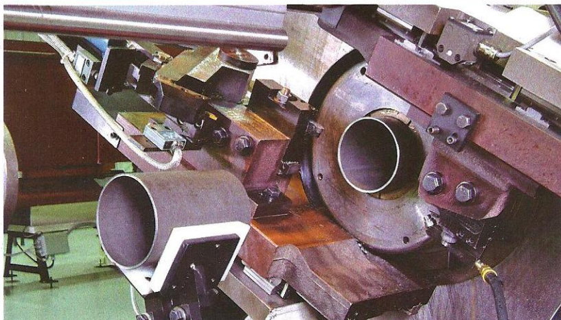
Lathe cutting and deburring.

Murphy and Nolan Inc. can handle any high-production or precision specialty lathe cutting project.